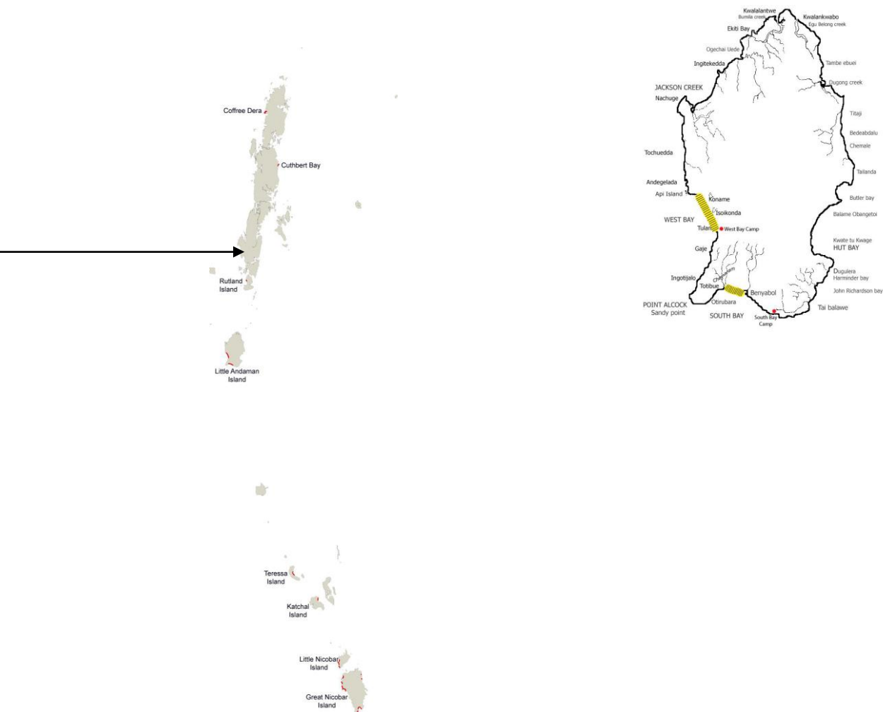
Figure 2: important leatherback nesting sites in the Andaman and Nicobar islands