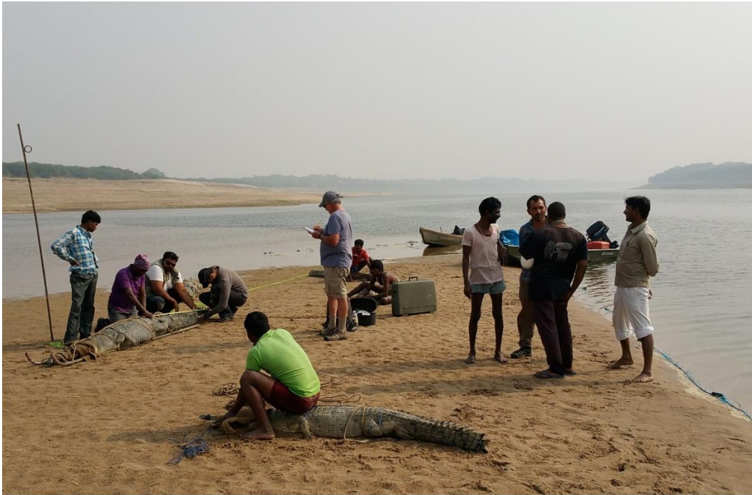
Captured gharials are tagged and released within several hours on-site