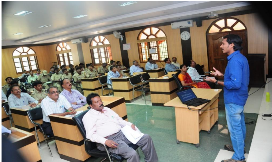
Workshop on King Cobra rescues for officials of the forest department.