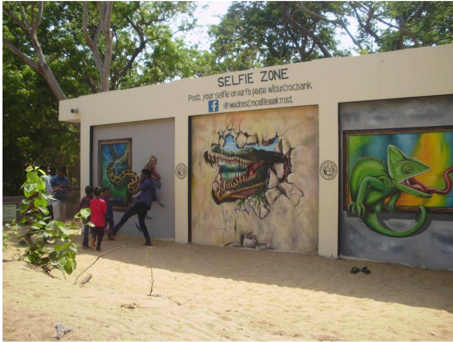
The new Selfie Wall is a huge success!!