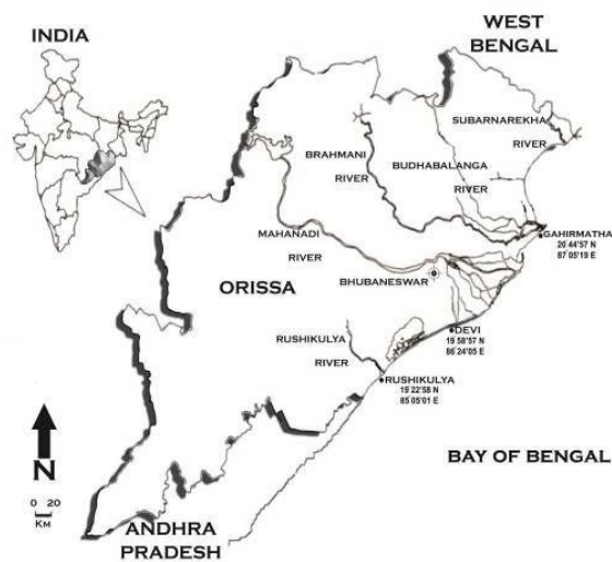
Figure 1: Mass nesting sites of olive ridleys on the Odisha Coast