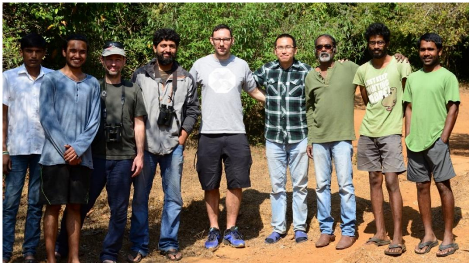
ARRS staff with the professors of the University of Exeter.